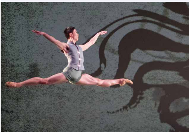
The Architecture of 無 《The Architecture of 無》

院方更會安排海外演出，如學生近期有機會前赴英國、加拿大、德國、法國、摩納哥、意大利、新加坡和台灣，以及北京、上海和澳門演出。