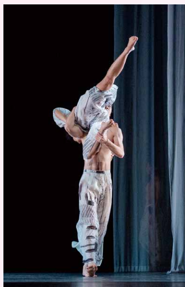
Set and Reset/Reset 《Set and Reset/Reset》

The School of Dance also holds international auditions in Southeast Asia. Please check the Academy website for information.