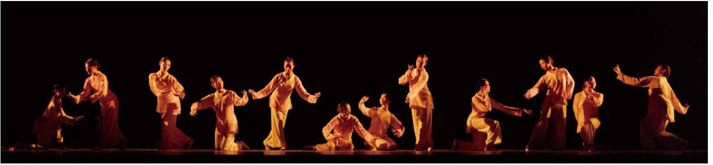
The Butterfly Lovers 《梁祝》