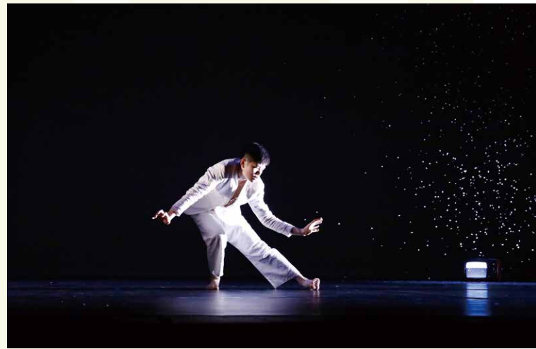
Staleness 《腐》