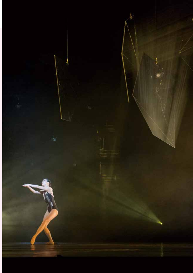
Eternity Formed by Fragments (Photo by Felix Chan) 《Eternity Formed by Fragments》陳振雄攝影

申請者除須符合其申請入讀課程的先決條件外，學院將要求申請者參加遴選及面試，以確定其是否適合入讀本學院。