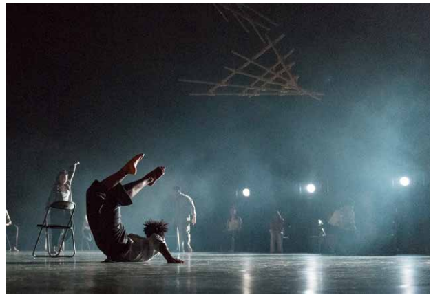
Three Fingers at Arm's Length 《Three Fingers at Arm's Length》