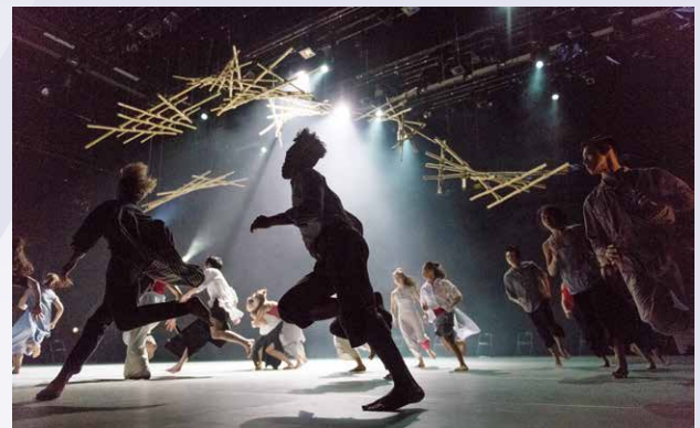
Three Fingers at Arm's Length 《Three Fingers at Arm's Length》

完成高等文憑課程取得滿意成績後，並符合院所訂的相關入學要求，則可循豁免部分學分的入學途徑，申請攻讀舞蹈藝術學士（榮譽）學位課程。