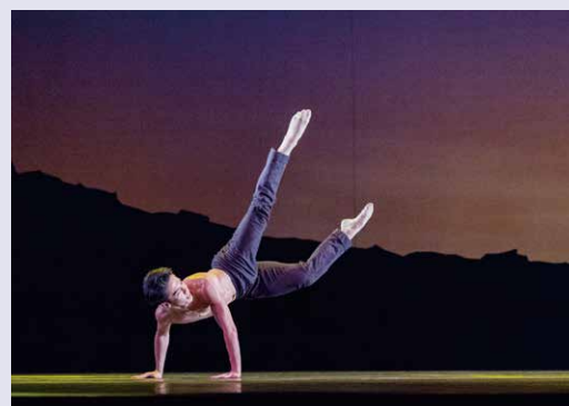
The Homeland 《鄉》