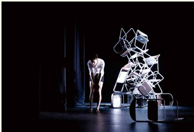
If I were you 《如果我是你》

舞蹈藝術碩士課程是為有志建立專業技能與知識的人士而設的深造進修課程。學生將受個別專業導師的指導，專注及自定導向式地學習。除必修科外，本課程提供多元化的選修科目，以迎合個別學生的需要及興趣。各學科由舞蹈學院、研究生課程中心及香港演藝學院內的其他學院共同提供，其一大特色是融合不同表演藝術的範疇、專業練習的機會、實踐與理論兼備及提供與不同學院學生合作的機會。學生可在這資源豐富及多元化的環境下，為其專業開拓新的發展方向，又或為舞蹈界注入新的創作和新元素。課程及報名詳情請參閱碩士課程手冊。